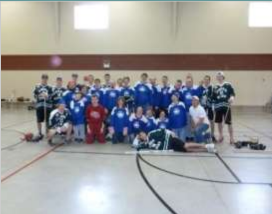
Woolwich Wolves Special Olympic Team

The event took place on Saturday, February 18, 2012 at Woodside Church in Elmira, was a huge success and enjoyed by many spectators. Special thanks to the Elmira Sugar Kings for their community spirit. Congratulations to the Woolwich Wolves, they truly worked hard and at the end of the day they were the Floor Hockey Champions!