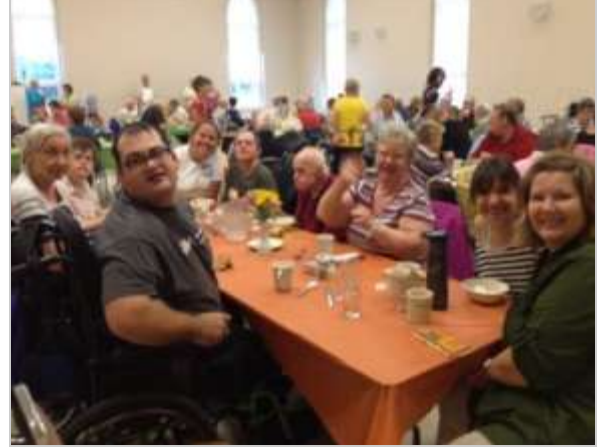
ALC and Alternatives at the luncheon held at Gale Presbyterian church on Tuesday 18, 2012.