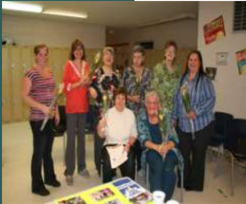
The ladies from Raising Mill Gate

“We invite you to share the lives of the Ladies of Raising Mill Gate”