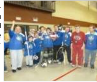
The "A" Team