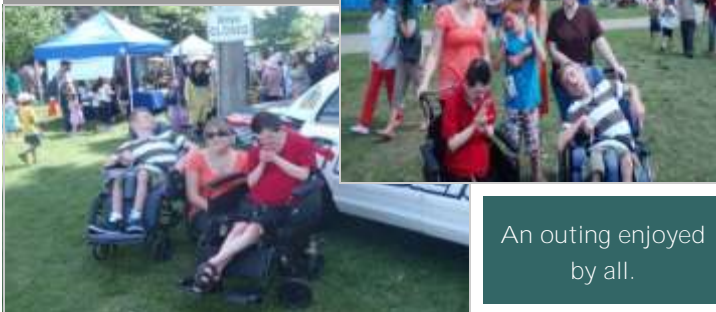
An outing enjoyed by all.